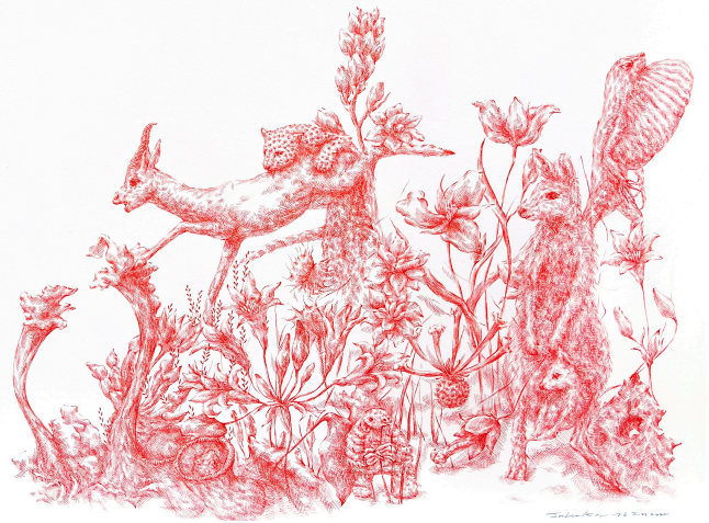
Fairies by Bui Tien, Watercolor on silk, 47 x 67 cm & Secret Garden #6 by JooLee Kang, Pen on paper mounted on wood panel, 50 x 61 cm

Dorothy Circus Gallery London is delighted to present Elements of the Anthropocene: Rebirth and Decay , an innovative group exhibition that brings together five visionary artists whose works explore the delicate equilibrium between humanity and the natural world. Through a diverse range of mediums and approaches, these artists navigate the ever-evolving dialogue between nature's resilience and the imprint of human intervention, capturing the tension between destruction and renewal in the Anthropocene era.